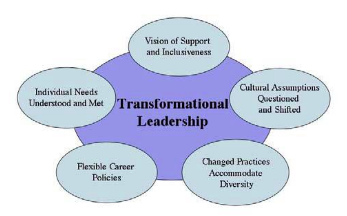
Figure 1: Transformational Leadership Model

faculty and staff; (c) peer mentoring circles for women faculty; and (d) entrepreneurship training for faculty women. Each activity attempts to include aspects of structured work, peer networking, and reflective practice.